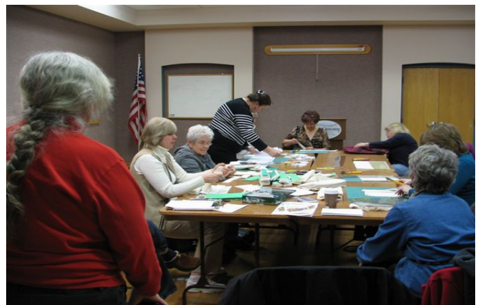
Tulsa group working on cutting 2” x 12” strips for exhibit at Living Arts. You can read about the New Genre Festival here— http://www.livingarts.org/

Everyone was cutting 2" X 12" strips for an upcoming exhibition at Living Arts in March during the New Genre Festival.