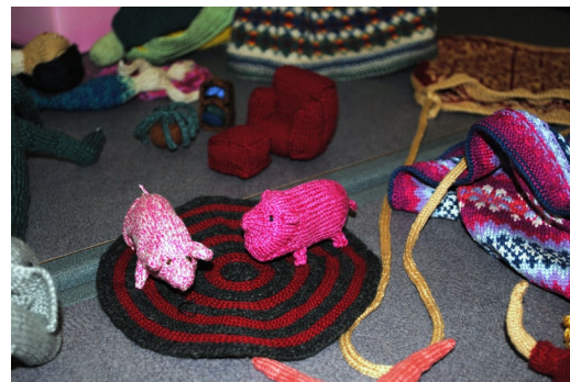
Close up of Sara's creative knitted items.