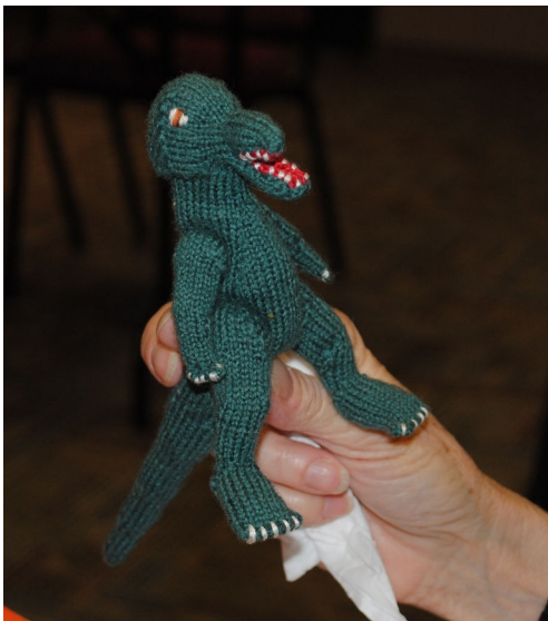
Sara Braden - knitted dinosaur