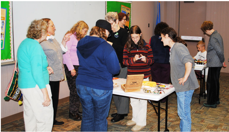
FAO group gather around the tables after the presentation.