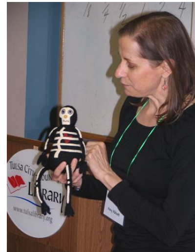
Amy Abbott—Doll made from child's drawing.