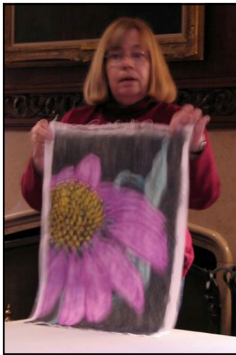
Debbie Ross—Pastel drawing on fabric.