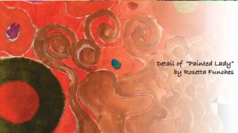
Detail of "Painted Lady" by Rosetta Funches